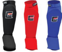
Slip-On Elastic Shin Pads Adult & Youth Sizes | 3 Colors