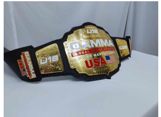
2024 Championship Belt