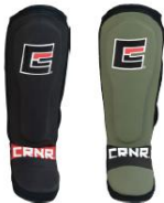
MMA Spar Shin Guards Adult & Youth Sizes | 2 Colors